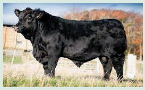
Rawburn Jumbo Eric T627