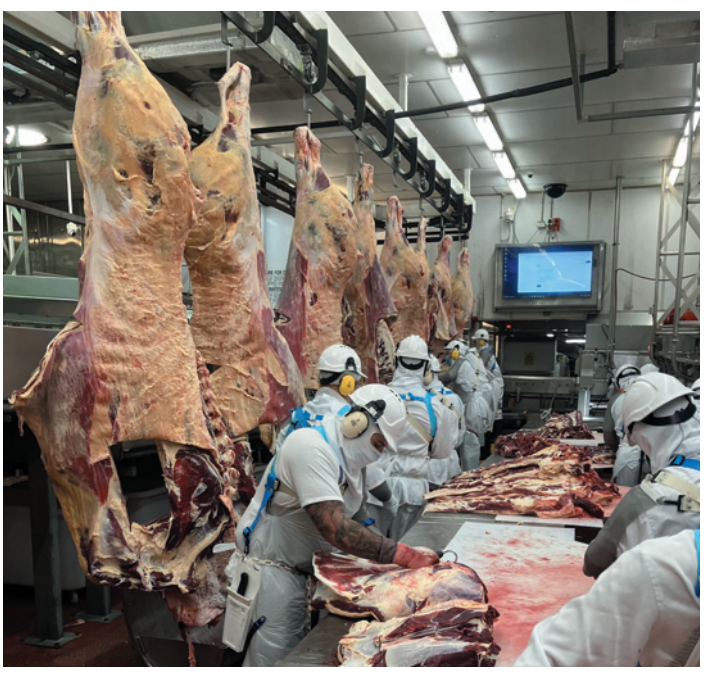
Raff Angus 100% Grass Fed Yearling Prime Milk Tooth MSA Graded Steers being processed at JBS Longford Plant Tasmania earlier this year.

Our bulls are purchased by clients who sell their progeny by the kilo - as weaners or as background feeders - while some maintain ownership through to target both the Yearling Prime and Jap Ox Grass Fed markets. For each of these varied programs they all want Angus Seedstock Bulls with the genetic potency to add as many kilograms as possible of raw weight into their progeny.