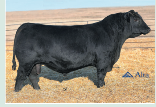
Ellingson Three Rivers 8062