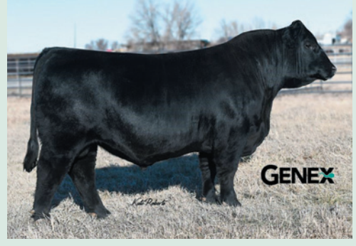
EG Eyes Onyou