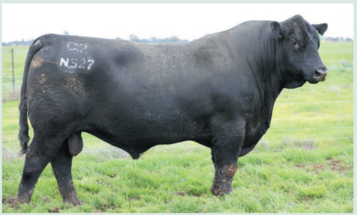
Raff Napoleon N327 - reported as a Breed Leader for NFI-F That is a bull reported to have the genetic capacity to eat less feed per day relative to his weight and rate of gain. Numerous sons sell Friday 18th August

"With the entire industry's goal towards Carbon Neutrality by 2030 and moderating methane, efficiency of our production system becomes increasingly important. An efficient animal that takes less days on feed and produces a heavy carcase weight must obviously produce less methane."