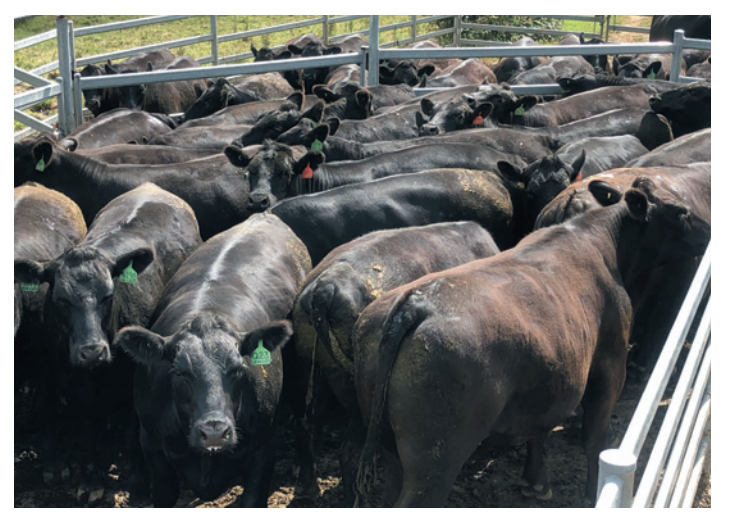
Heaviest Carcase Weight was 410kg with this group averaging 367kg Carcases.

Whilst the maternal line's ability to calve with ease and rebreed annually while staying functional and sound is paramount, the ultimate profitability of their calves cannot be truly determined until such has a dollar value placed on them at a carcase standpoint.